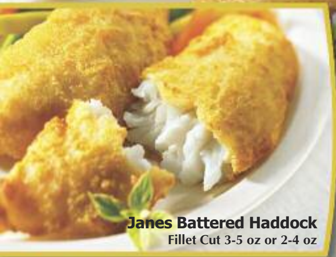
Janes Battered Haddock Fillet Cut 3-5 oz or 2-4 oz