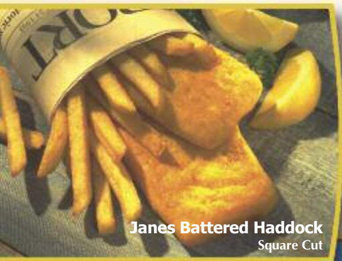
Janes Battered Haddock Square Cut