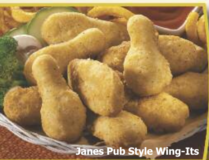
Janes Pub Style Wing-Its