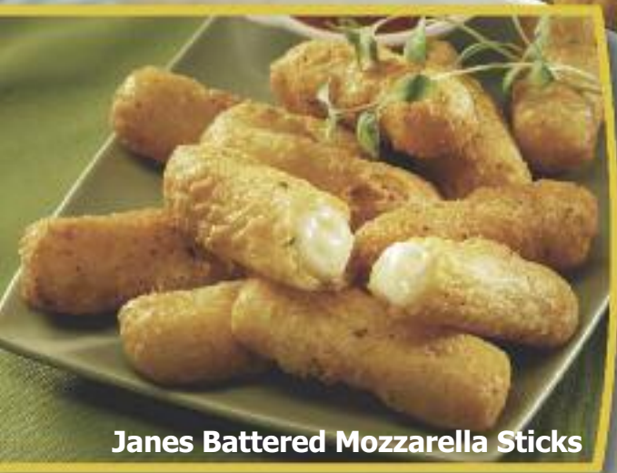
Janes Battered Mozzarella Sticks