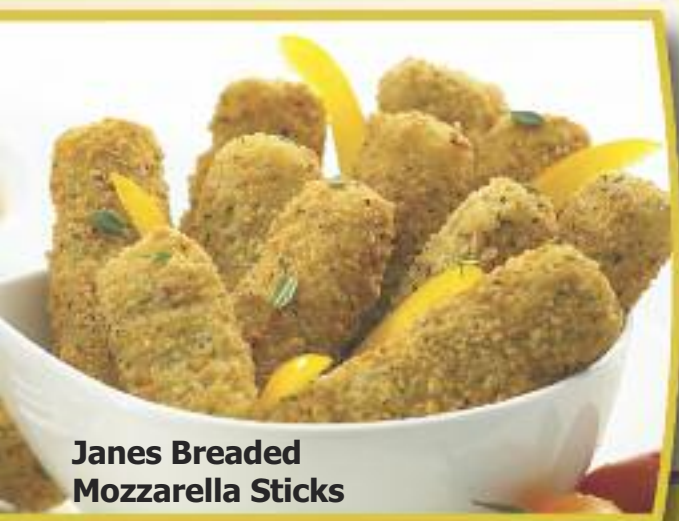
Janes Breaded Mozzarella Sticks